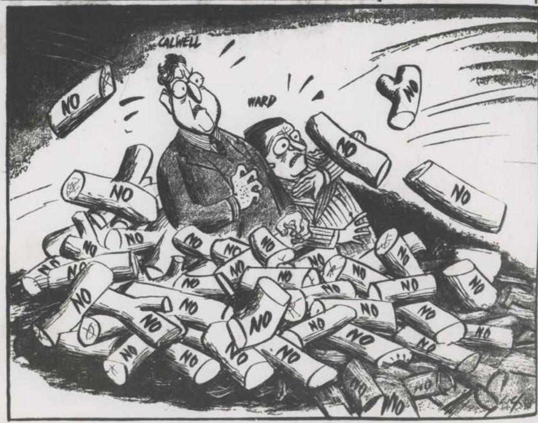
The niggers in the woodpile