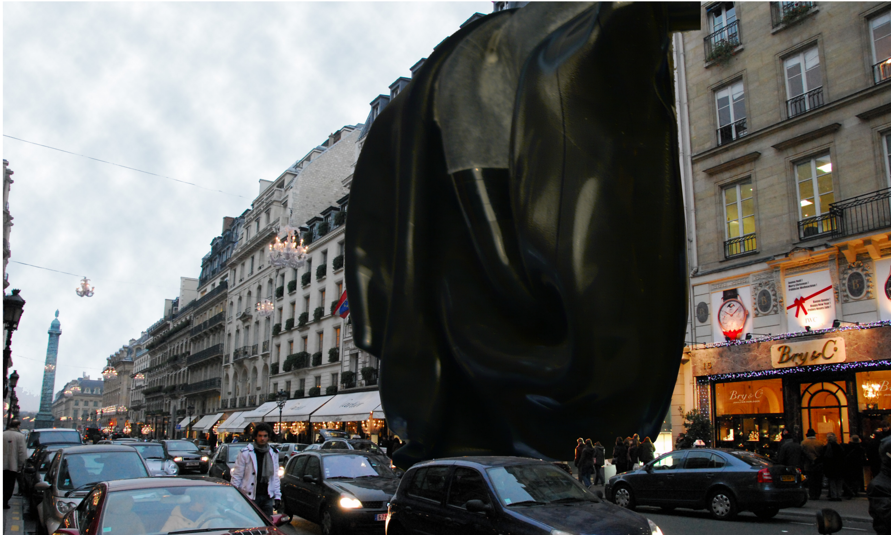
View from street level Rue De La Paix