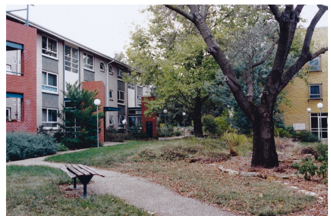
Illustration 4.130 Condamine Court