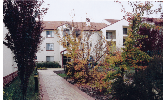
Illustration 4.129 Braddon Gardens