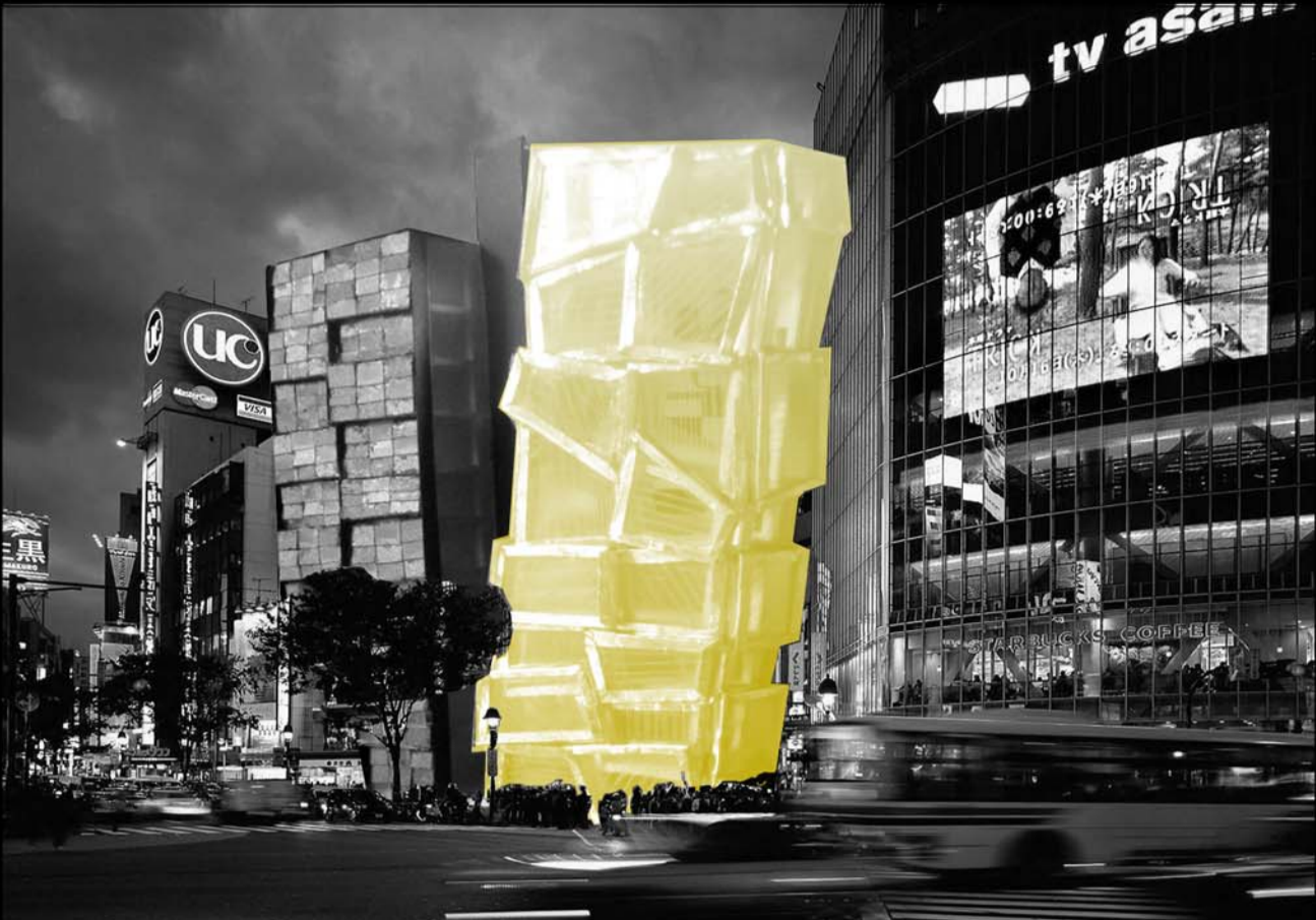
POSTCARD IMAGE 1