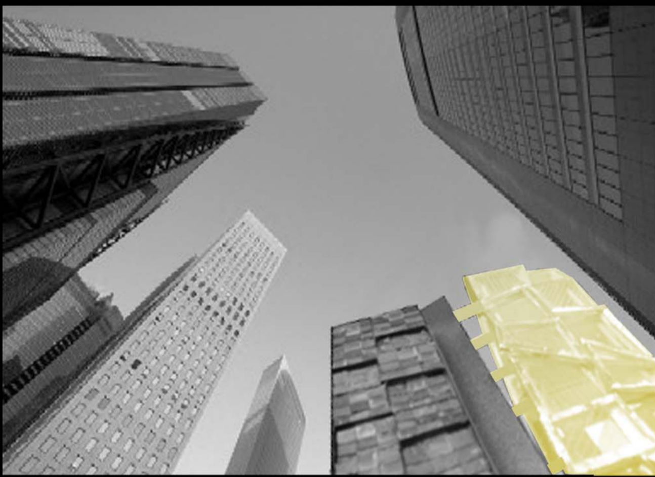
POSTCARD IMAGE 2