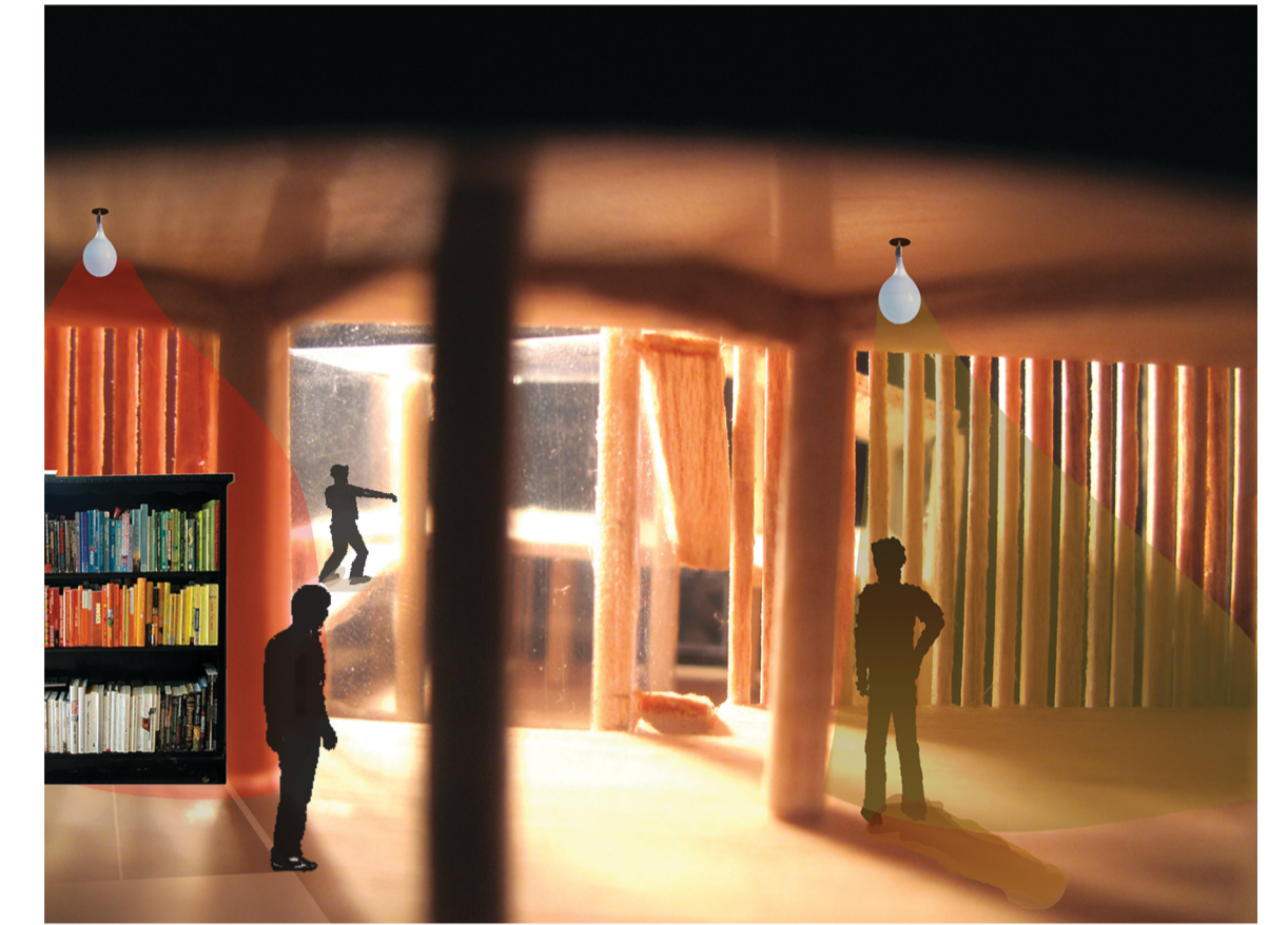
POSTCARD 3 INTERIOR, BOOKSHOP

In the city of Venice, walking on the wooden walkway above the river, one will end up with the new bookshop of the city. The shop has two components to it, the bookstore and the café. Entering the bookshop through the façade made by thin wooden trips, one shall experience a different side of the city: a feeling of contemporary and a sense of present. Nevertheless, the large glass windows let the outer scenery interacting with the interior of the building, which well connects the two together. A center courtyard is built to connect the café and the bookstore together. The yard reduces the sense of being placed in an interior space and gives people a chance to lookout from the building. To circulate around the building, one needs to climb up the stairs around the center courtyard. At the same time, the building itself is viewed in the person's eyes from different angles. The centre courtyard, the roof garden on top of the café and the outdoor space in front of the café forms three exterior garden spaces all together. This creates a sense of open and freedom for the people entering the shop and makes them wish to spend longer time in the shop.