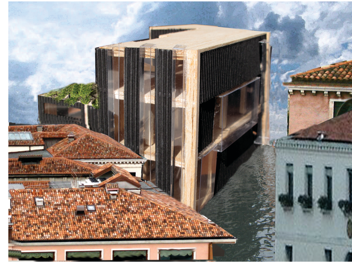
POSTCARD 1 EXTERIOR, ROOF GARDEN