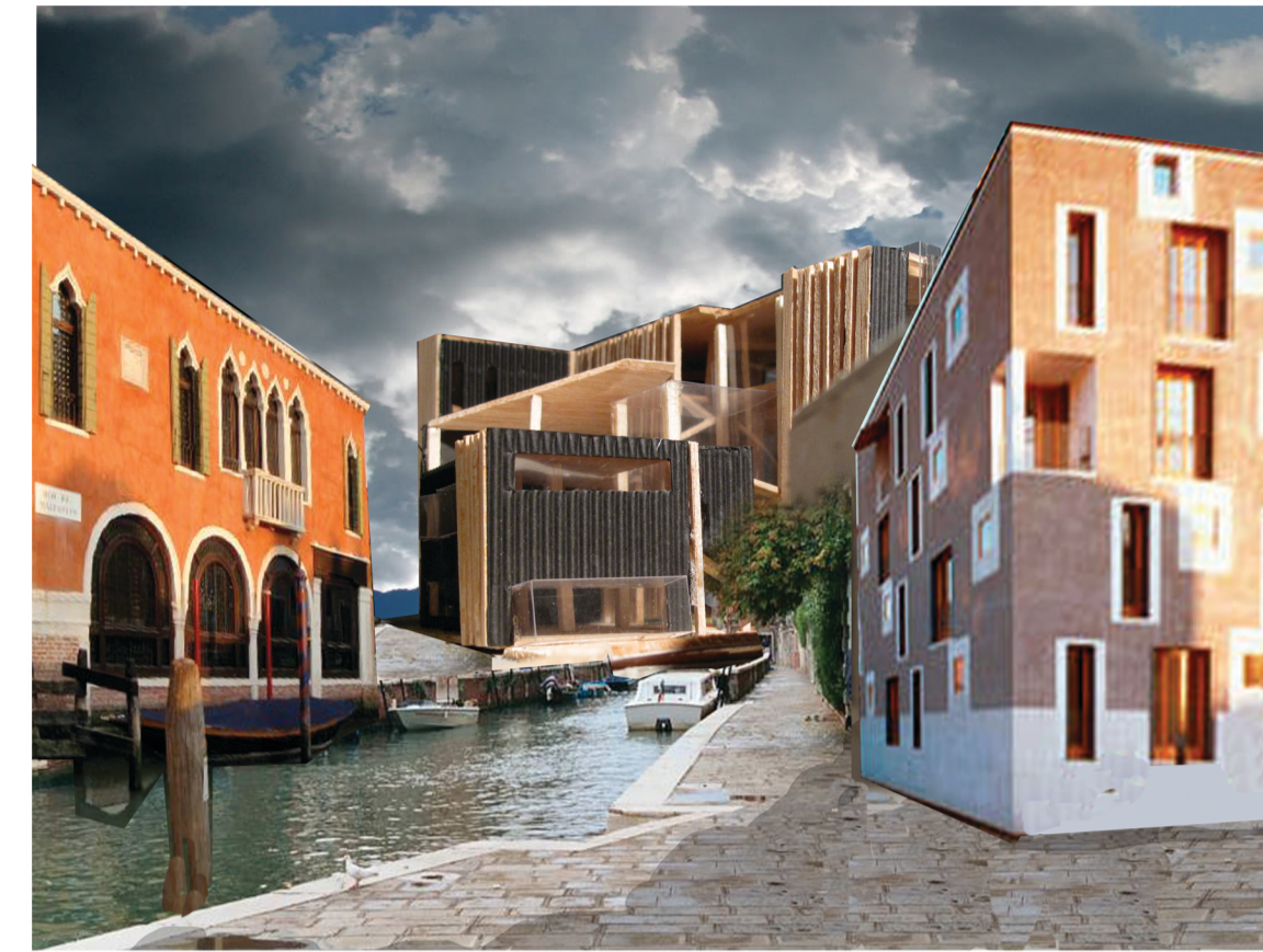
POSTCARD 2 EXTERIOR, CAFE ENTRANCE