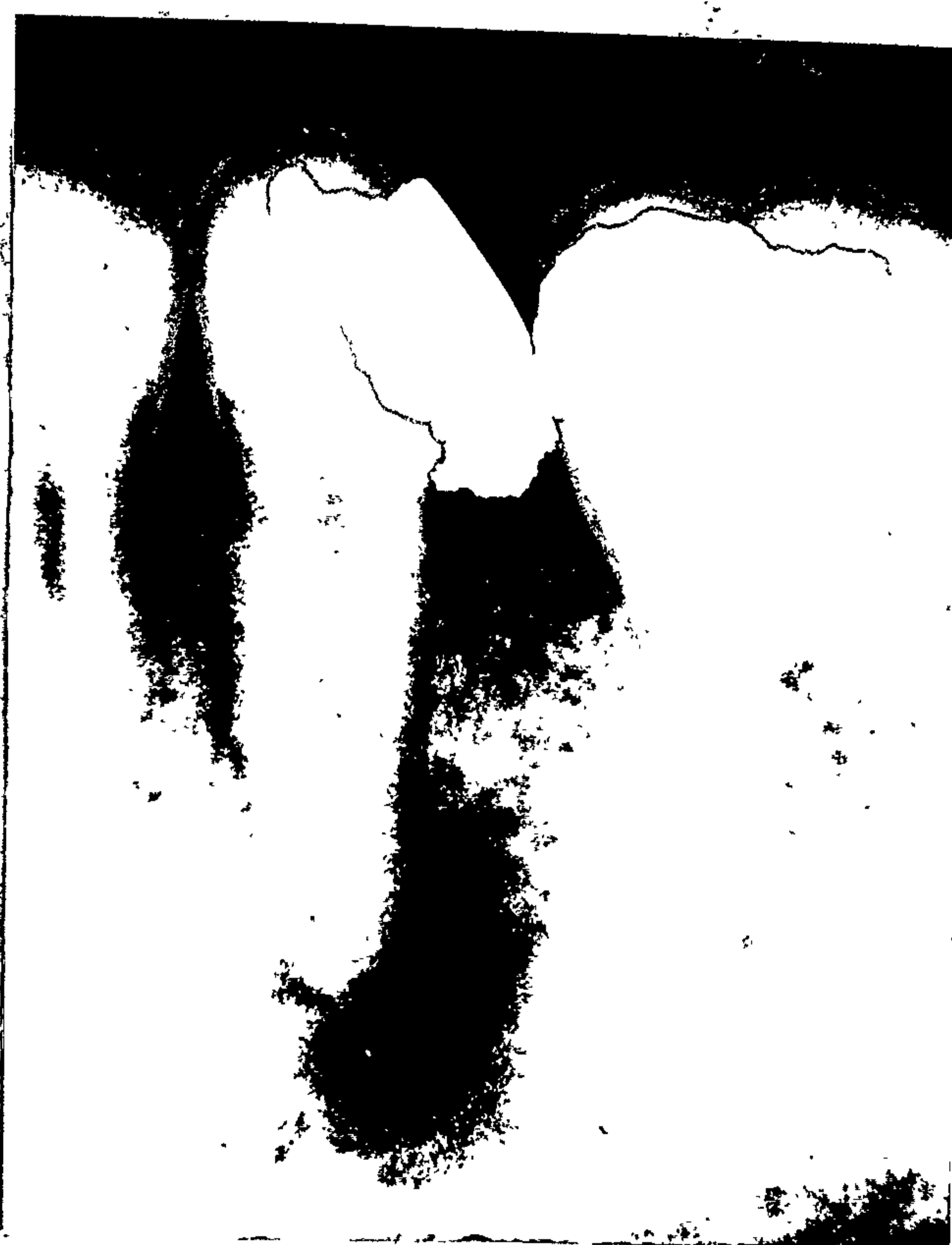
Radiographic view of bone loss associated with overhanging margins.