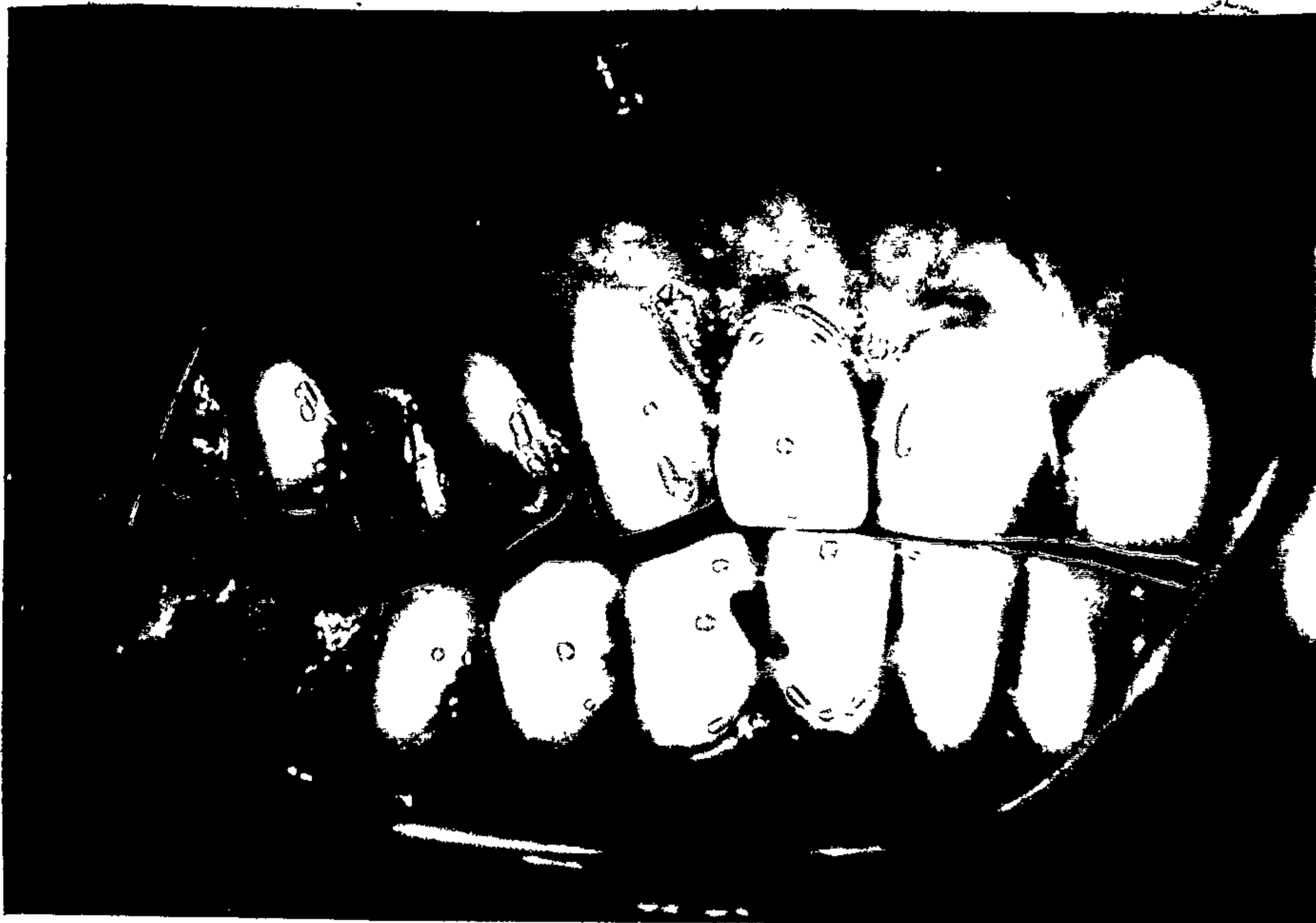
Food traps mesial and distal to LR6. Radiograph shows inadequate contact and uneven marginal ridges. Note overhanging margins.