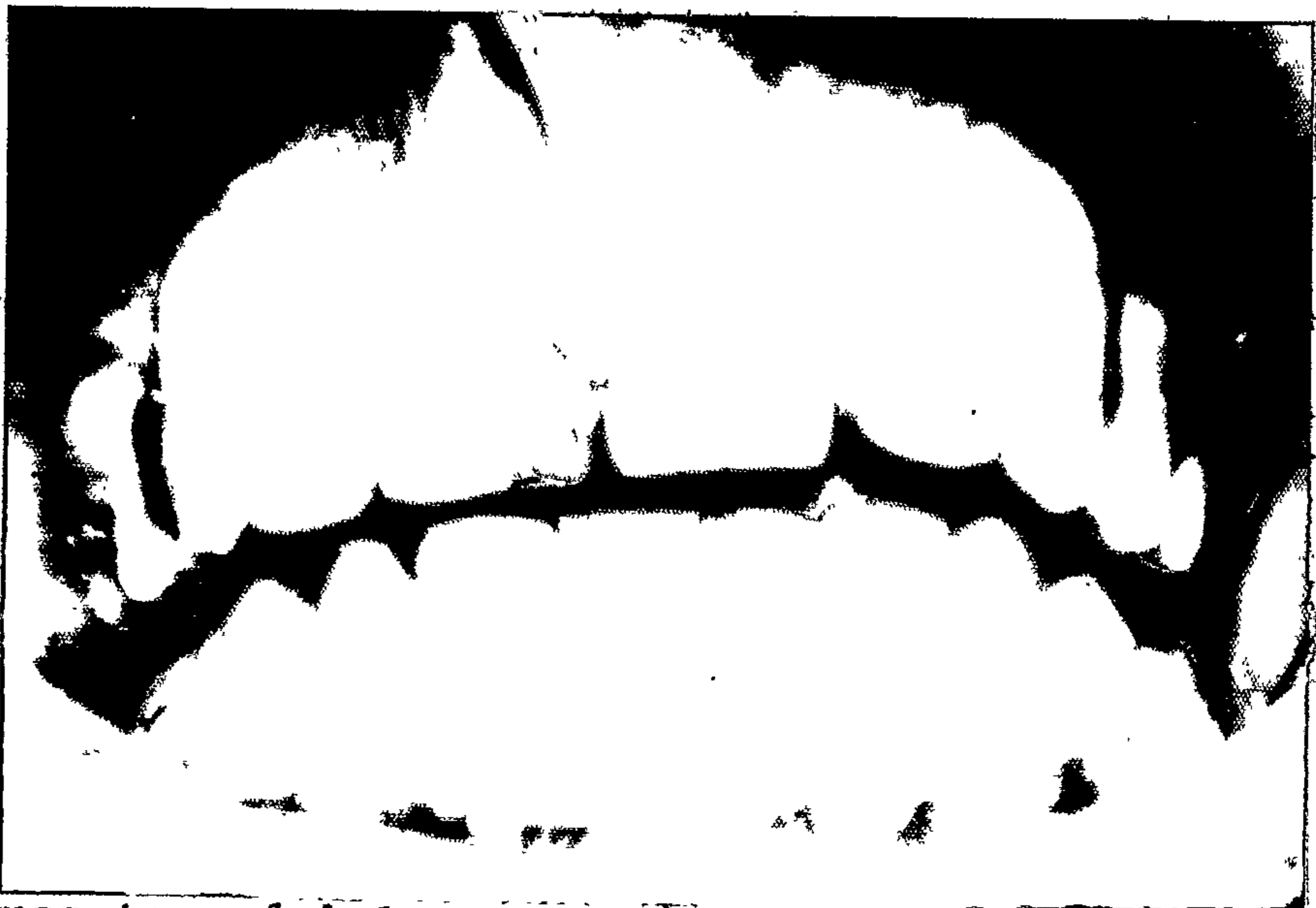
Overcontoured inlay UR1, displacing the interdental papilla.