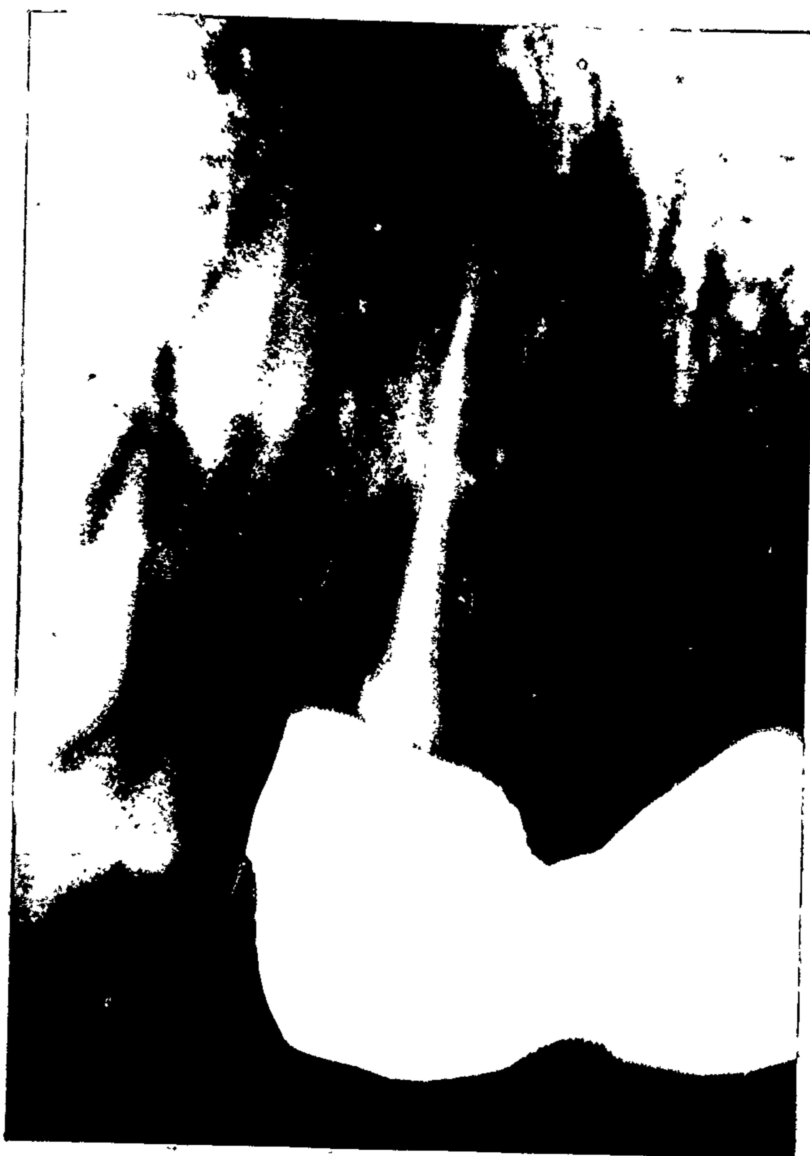
VMK cantilever bridge replacing UL1. UR1 has II mobility and radiograph shows signs of traumatic occlusion.