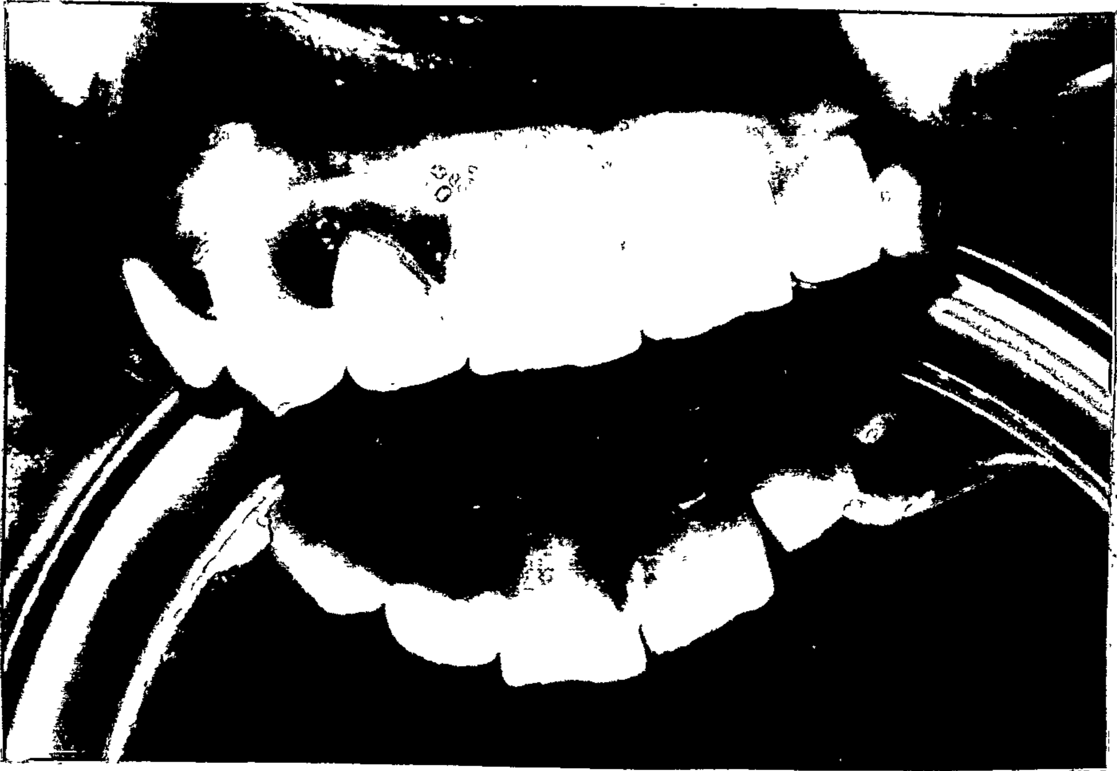
Composite resin mesial UR3 and distal UR1, porcelain crown UR2. Overcontoured linguo-distal line angle UR1, filling embrasure. Marked gingivitis labially and lingually with lingual gingival recession.