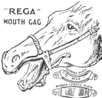
"REGA" MOUTH GAG

We have realised, throughout, the urgent need for Veterinary Instruments, production of which will be resumed at the first possible moment.