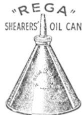
"REGA" SHEARERS OIL CAN