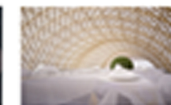
reference images from left to right Vincent Callebaut's lily pad, a floating ecopolis, faux green wall, jelly fish, water tank, Shigeru Ban's paper pavilion