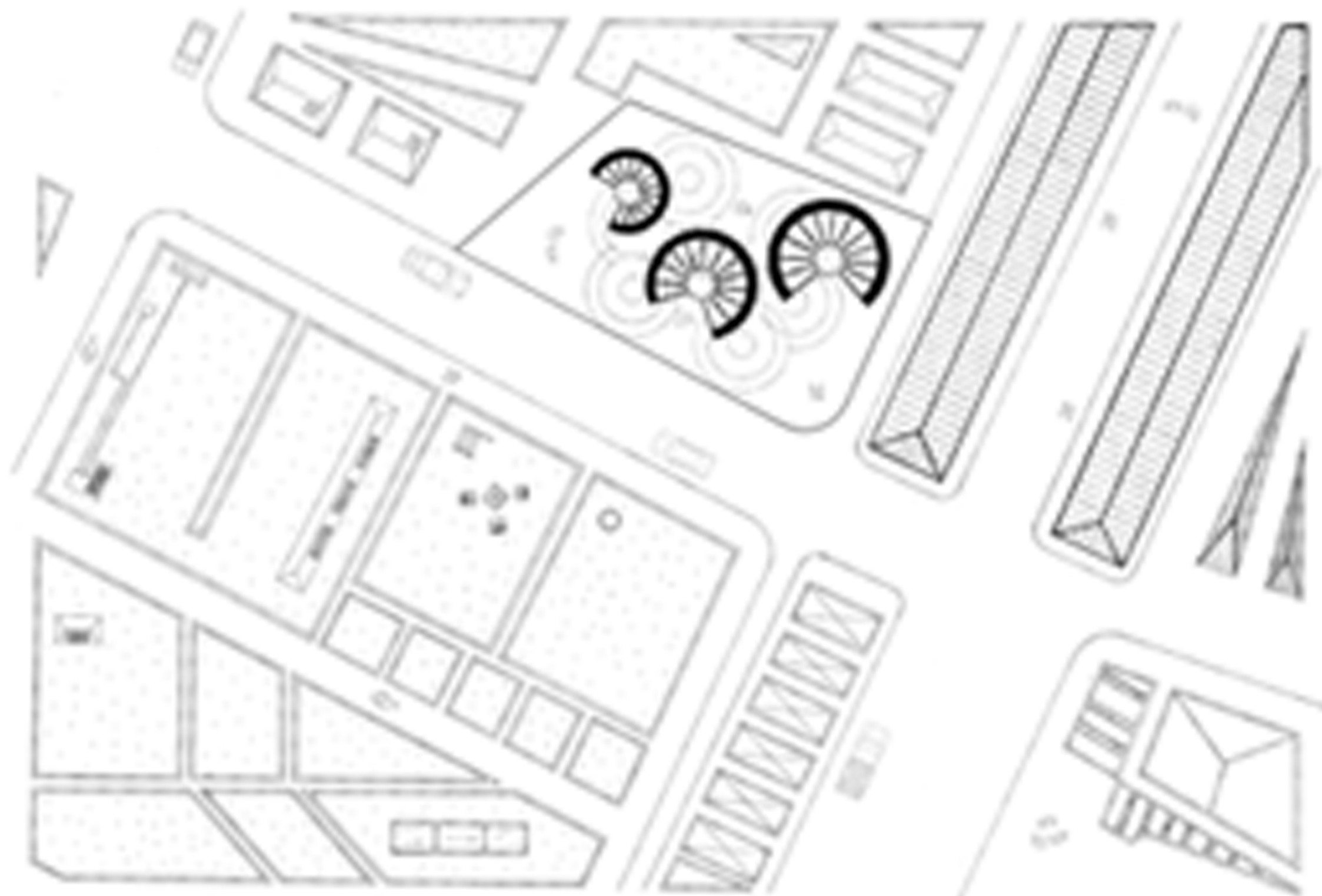
site plan 1:200