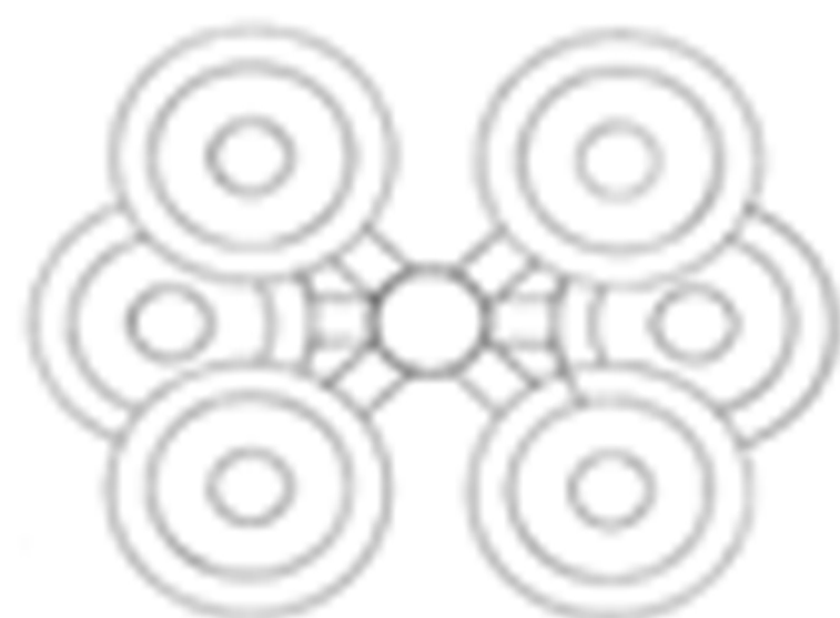
arrangement of pods 1:200