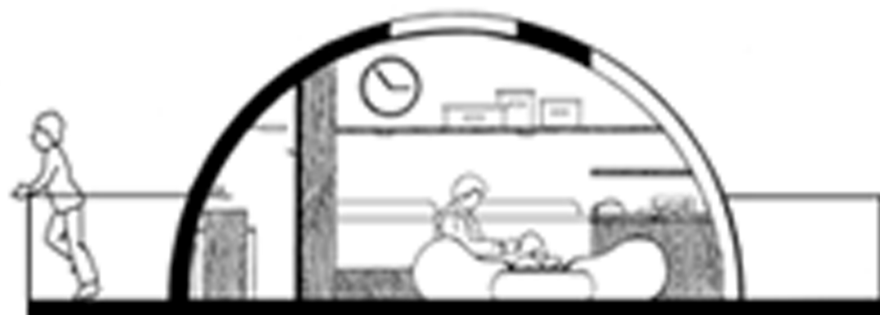
section of pod 1:50