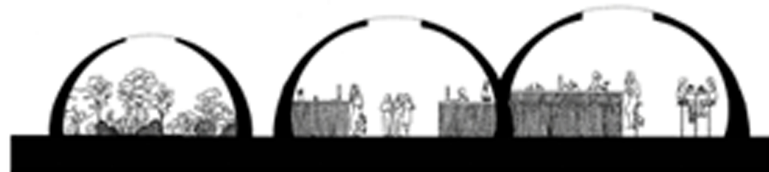
section of domes 1:50