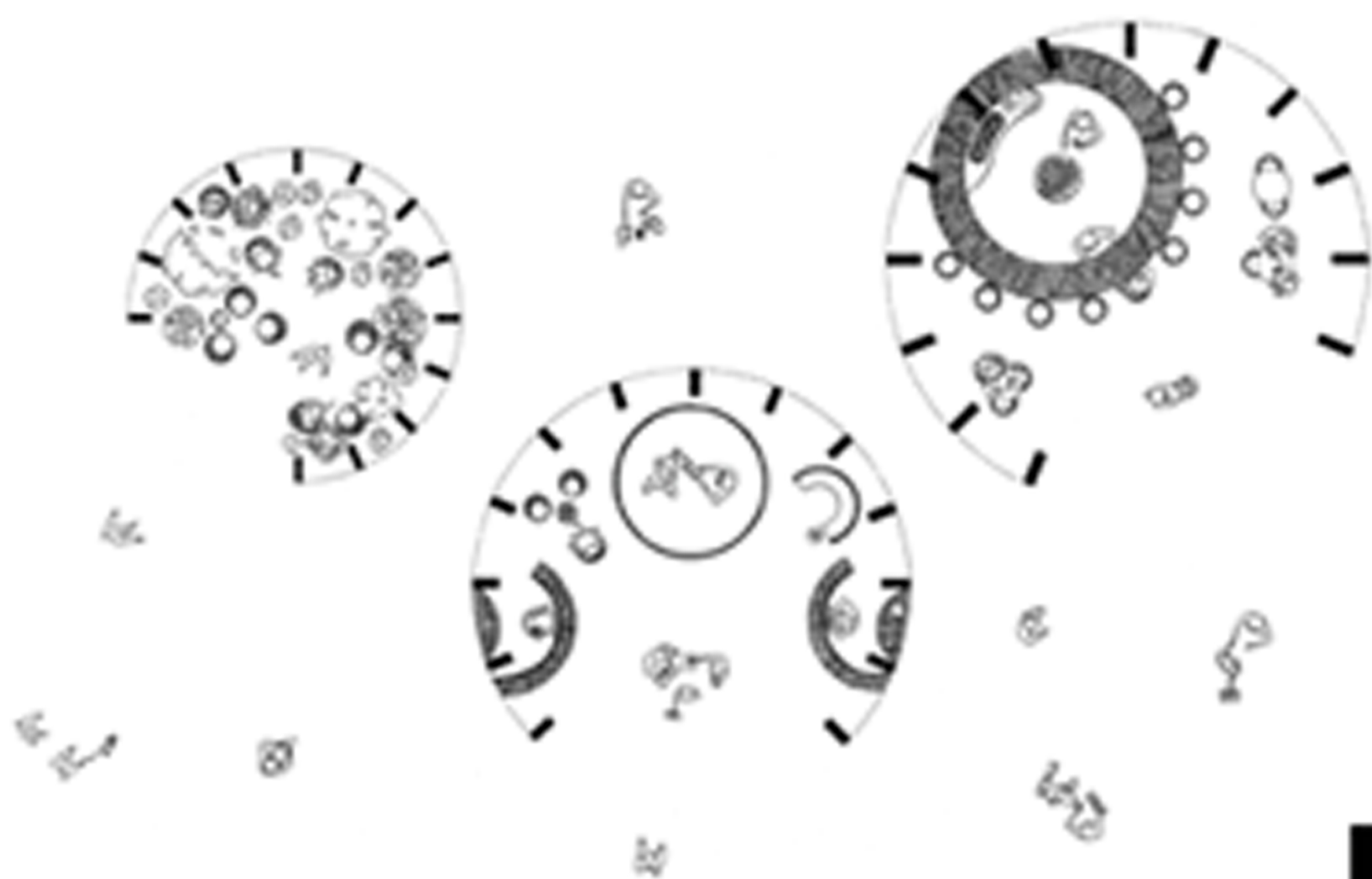
plan of domes 1:50