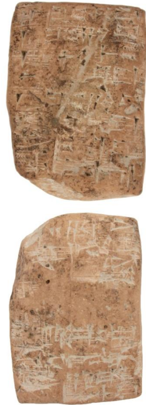
Cat. 28 (obverse and reverse)