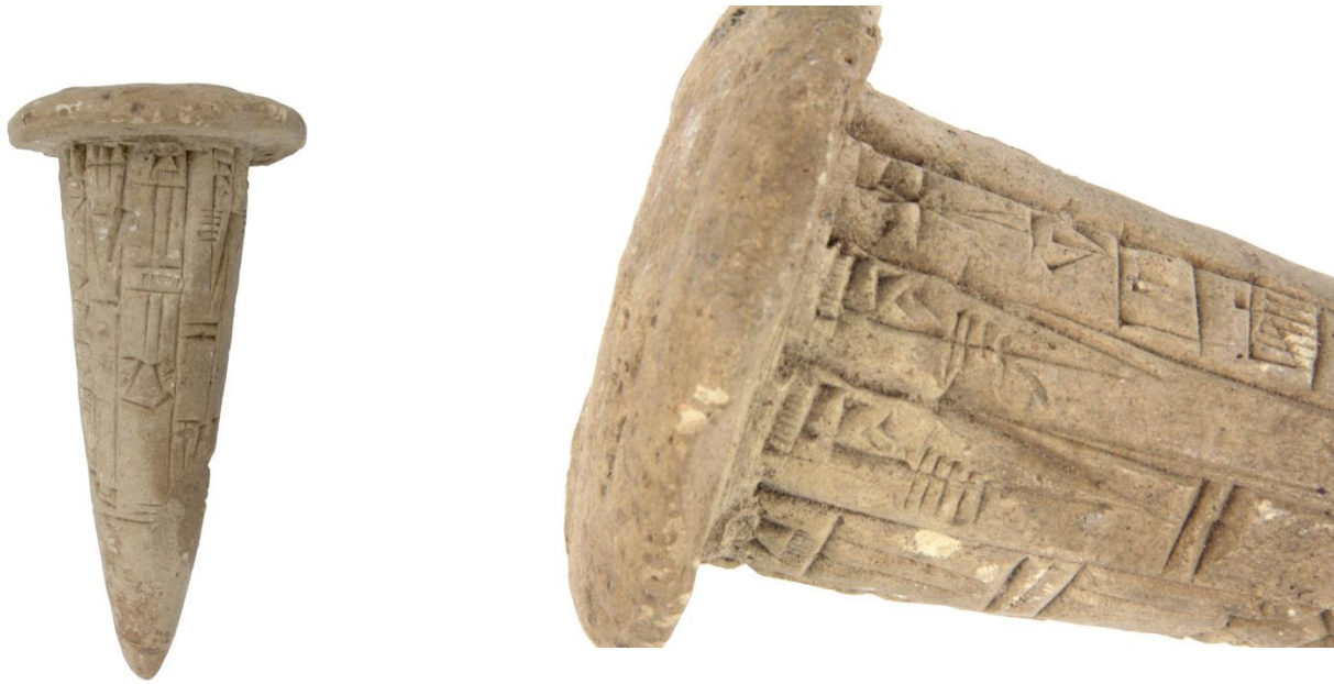
Cat. 22 (with detail)