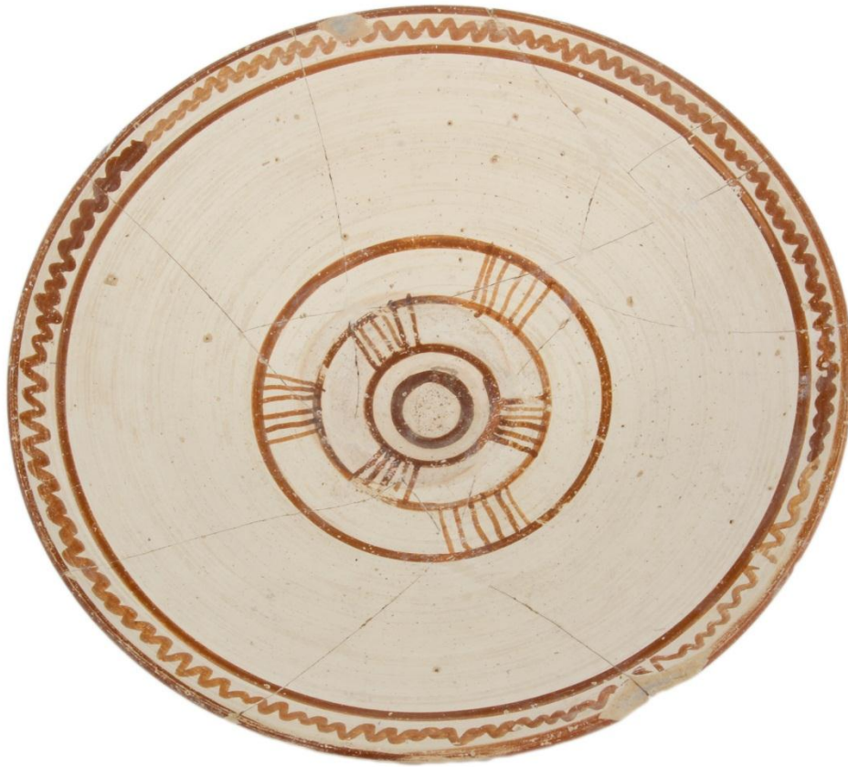
Cat. 106 (interior)

(4th–7th century AD) when Pella, still an administrative centre of the Empire and the seat of a Bishop, was adorned with three basilicas and a major fortress.