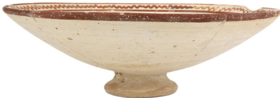
Cat. 106 (profile)