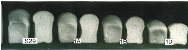
Fig. 2. Loaves baked from monosomic lines 1A, 1B and 1D of cultivar S29