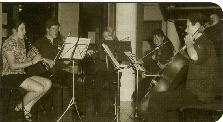
Future Vets make music: the classical ensemble

A new tradition was established in August with the inaugural VetWeek, a series of linked events celebrating Veterinary Science and showcasing the Faculty, its students and staff. Kept to two and a half days for purely logistical reasons, VetWeek revealed a range of hidden talents that crossed many creative boundaries.