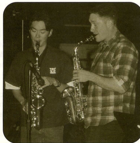
Future Vets performing some great jazz

Sponsors for VetWeek included Guild Insurance, IAMS, Reed Elsevier, Vetgroup Australia, Hill Pet Nutrition, Boehringer Ingelheim, CSL limited, Australian Veterinary Association, Bayer and VetSoc.