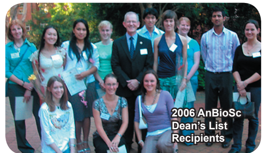
2006 AnBioSc Dean's List Recipients