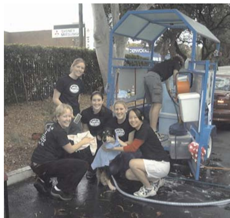
Students operated five mobile dog wash units to shampoo more than 230 dogs in 6 hours, a feat that smashed the previous record held by Murdoch University.

The Faculty has advertised a new Sesqui Chair in Farm Animal Health, supported by the University and Meat and Livestock Australia. This position will bring a new focus and capacity to this important area for training and research, helping to protect the Australian livestock industries.