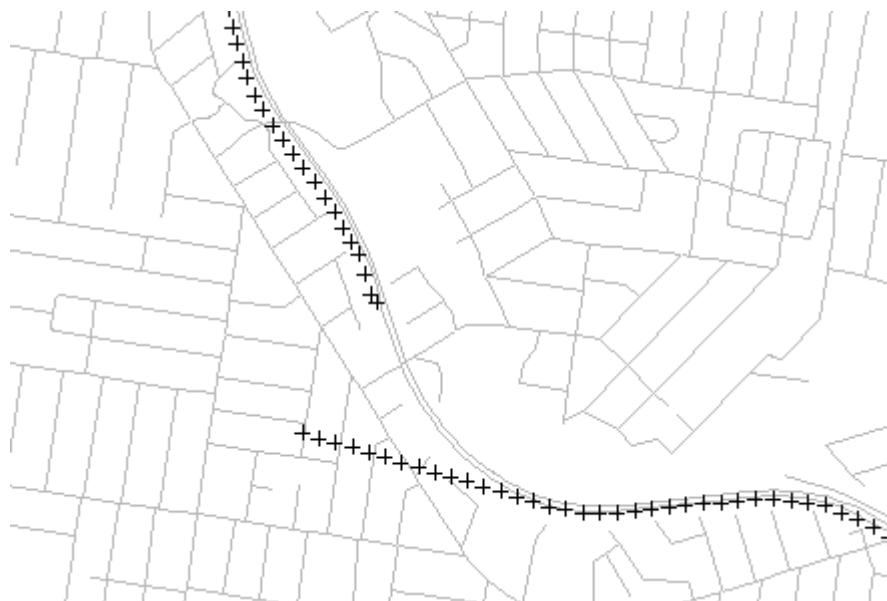
Figure 2 Example of straight-line drift, where a GPS receiver has lost its accuracy. The GPS continues to record locations based on its last known speed and direction.