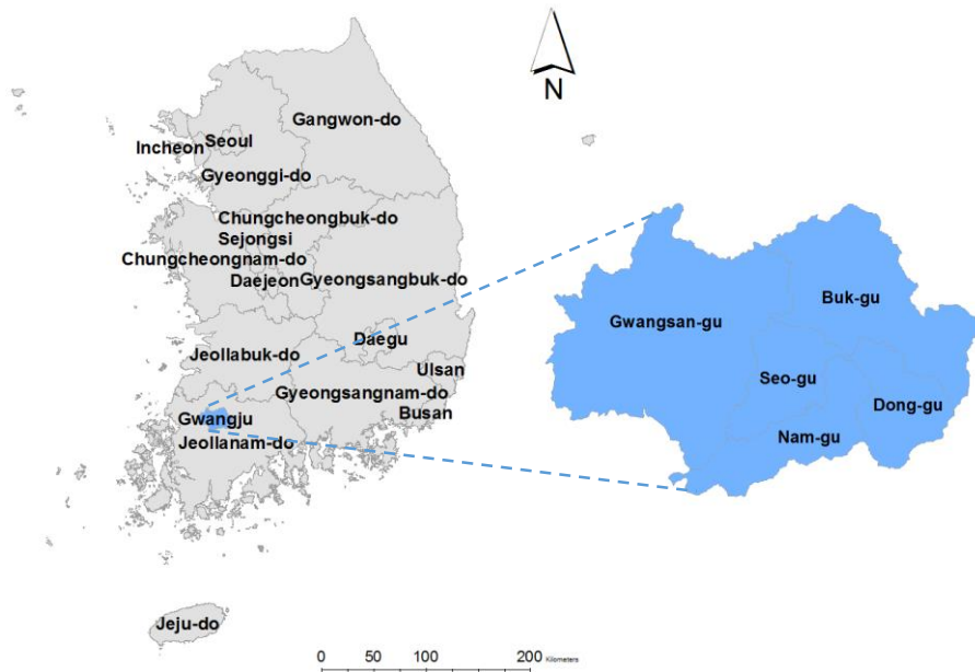
<Figure 1> Gwangju Metropolitan Area

Gwangju was selected as the case study for two reasons: 1) the heavy use of public transit; and 2) its plan for subway network expansion in a few years. Almost 40% of passenger movements have been made by public transit in the last 10 years, which indicates that an improved system can make a difference for many people. Also, the subway expansion plan gave us an opportunity to evaluate its impacts based upon the detailed network changes.