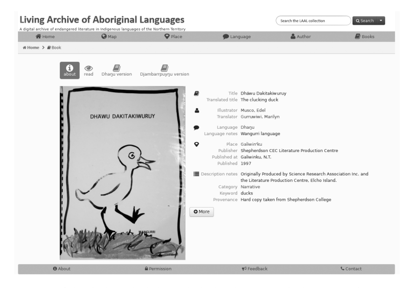
Figure 5.2 'The clucking duck'. http://laal.cdu.edu.au/record/cdu:31310/info/.