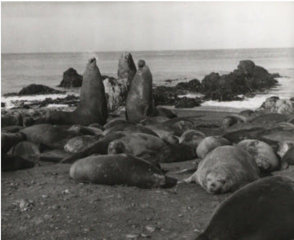
Plate 1. Two bull elephant seals arguing over control of a harem