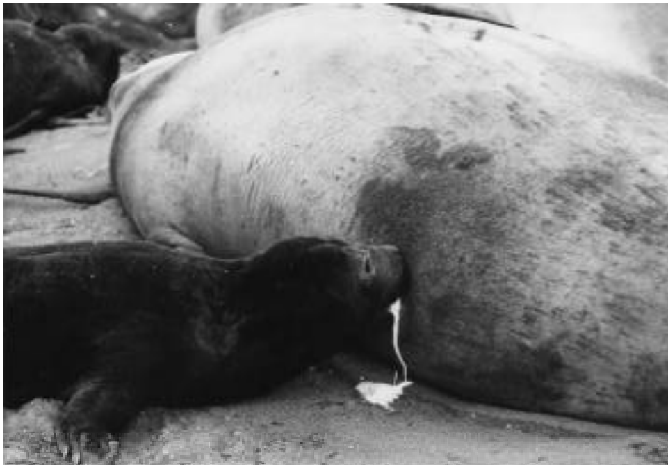
Plate 2. Elephant seal pup, about 10 days old, drinking from its mother within a harem.

growth of bone and viscera. The composition of the milk changes as lactation progresses, particularly the fat component, which increases from about 8% at the beginning to about 50% toward the end of lactation. Growth during this period is critical, because the pups fast for several weeks after they are weaned, and a critical body mass must be attained by weaning to see them through that postweaning fast, until they go to sea as nutritionally independent individuals. Further, they require at least a minimum thickness of blubber to insulate them when they enter the icy waters of the Southern Ocean. 5