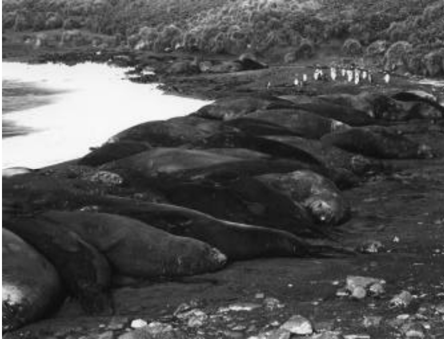
Plate 4. Although highly thigmotactic on land, particularly when moulting, Elephant seals are solitary at sea