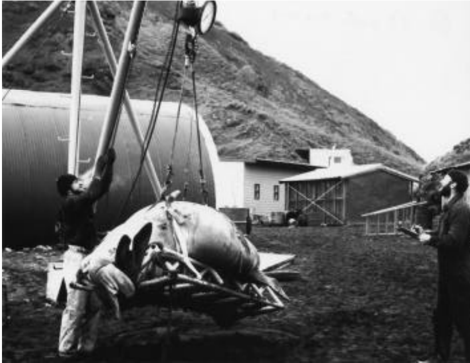
Plate 3 Weighing a large bull Elephant seal

Dr Gerald Lim was the expedition doctor at Macquarie Island in 1965, and took an interest in the blood of elephant seals. We measured the blood volume of adults and noted that it was great, representing more than twice the relative blood volume of terrestrial mammals. If the large amount of fat (up to 50% body weight in seals) is discounted, the ratio of blood volume to lean body weight is more than three times that of terrestrial mammals. Further, the erythrocytes are large, and haematocrit is variable but up to 60% and even 65% in some individuals. This is not the situation in neonatal seals, whose blood values do not differ greatly from those of terrestrial mammals. So like the musculature, the cardiovascular system develops in response to functional demand. We noted further that the spleen is unusually large in elephant seals, and we speculated that it might be particularly important in the diving animal to store erythrocytes, and that this might account for the variation in haematocrit that we had observed.