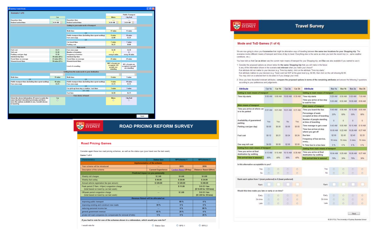
Figure 3 Examples of choice scenarios – complex or relevant?

What should dictate the dimensionality of choice experiments is the 'relevance' of attributes and it should prevail over complexity (Hensher 2014). Relevancy suggests comprehensiveness, provided there are no crucial attributes that have been excluded. Indeed, respondents often struggle with a choice response that is a true reflection of their preferences, which are often based on consideration of other attributes that are not revealed but which contaminate the assessment of the offered attributes. The challenge then becomes one of presenting the information in a way that is comprehendable. This requires creative formats and extensive piloting of the instrument to ensure that the data has meaning in the way it is planned to be used.