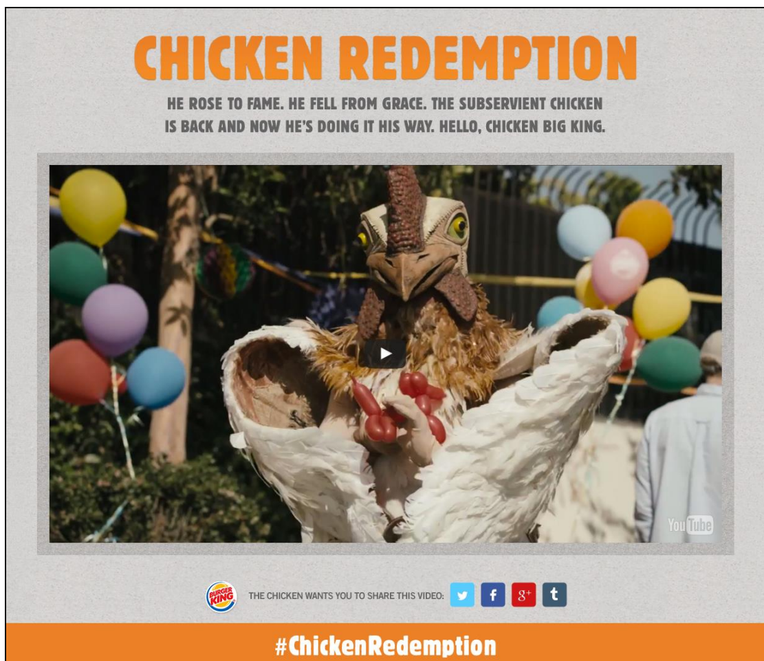
Figure 2. The successful subservient chicken campaign by Burger King.