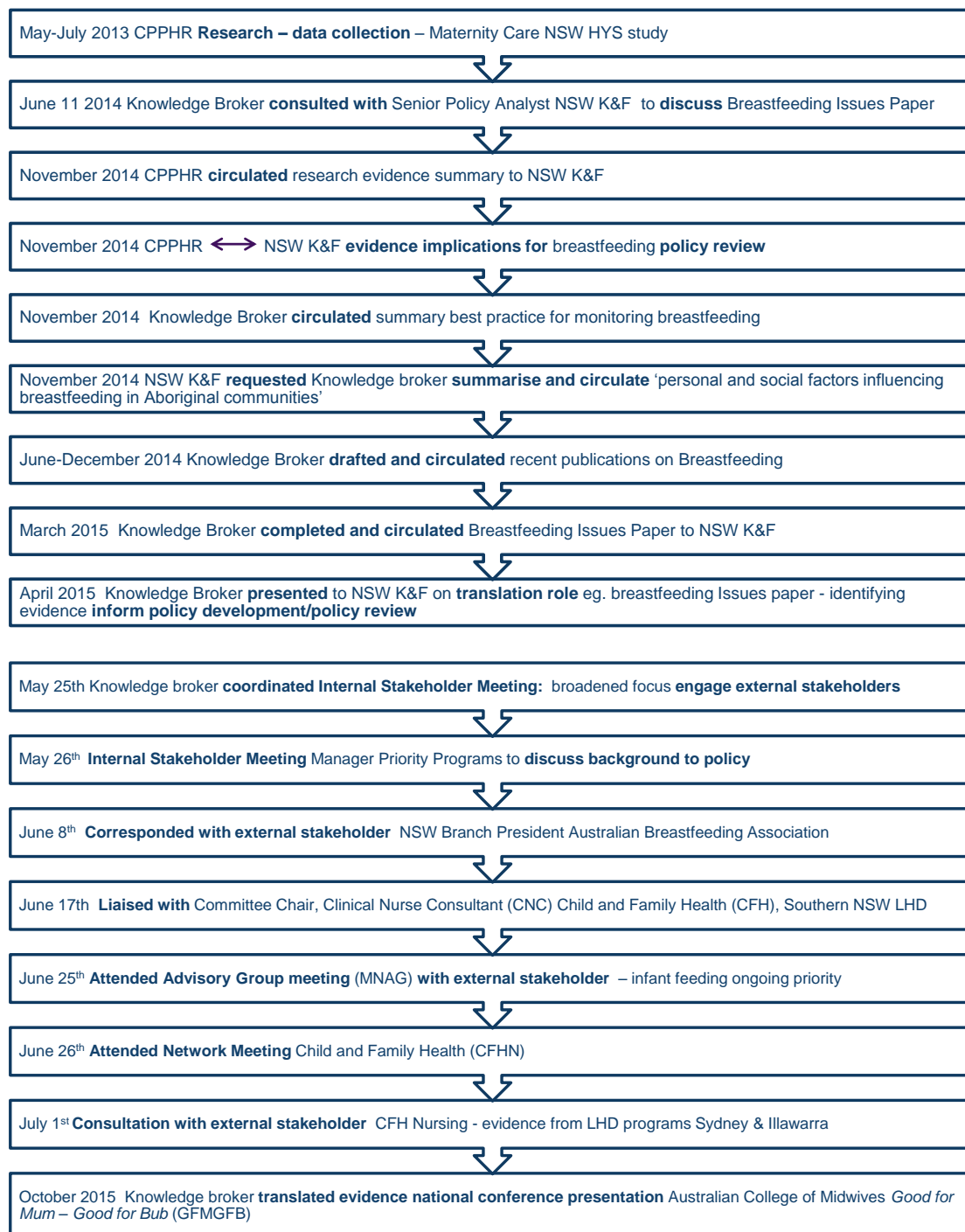
Figure 2: Timeline of Case Study 2013-15 Breastfeeding – current evidence summary

Implementation Officer sourced and circulated a national report about recommended indicators for monitoring breastfeeding to assist personnel working on the policy in NSW Kids and Families.