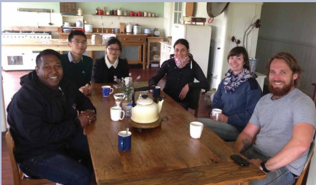
Central Tilba NSW, River Cottage project

Positive and valuable feedback was received from students and enterprises across a range of impact indicators. A sample of this feedback mapped against our objectives is provided below. It is worth noting that while growth helps expand our reach, it needs to be carefully managed to ensure the value we deliver is not diluted, and resources don't become stretched.