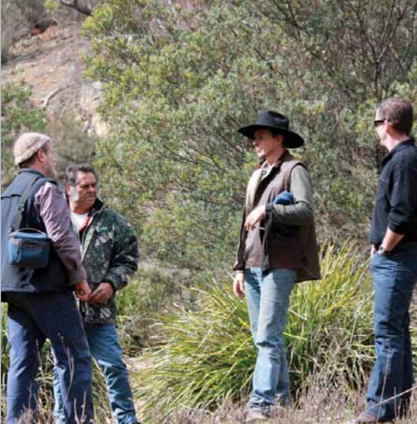
Eden NSW, Bundian Way project