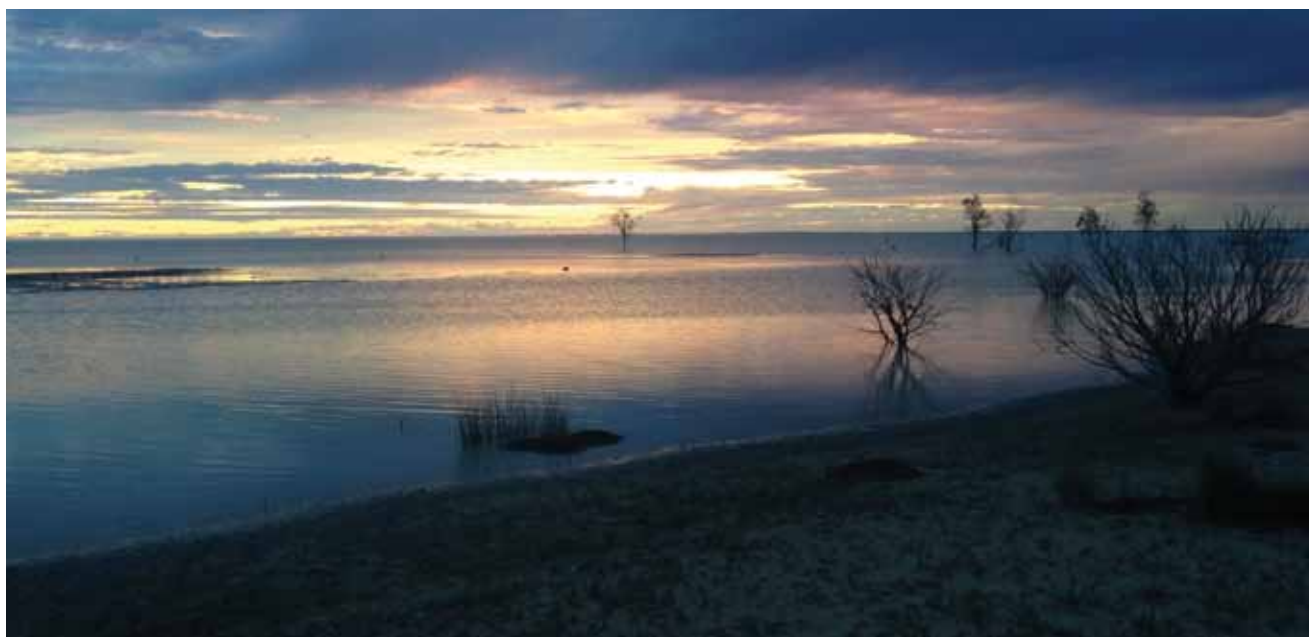
Broken Hill, NSW.