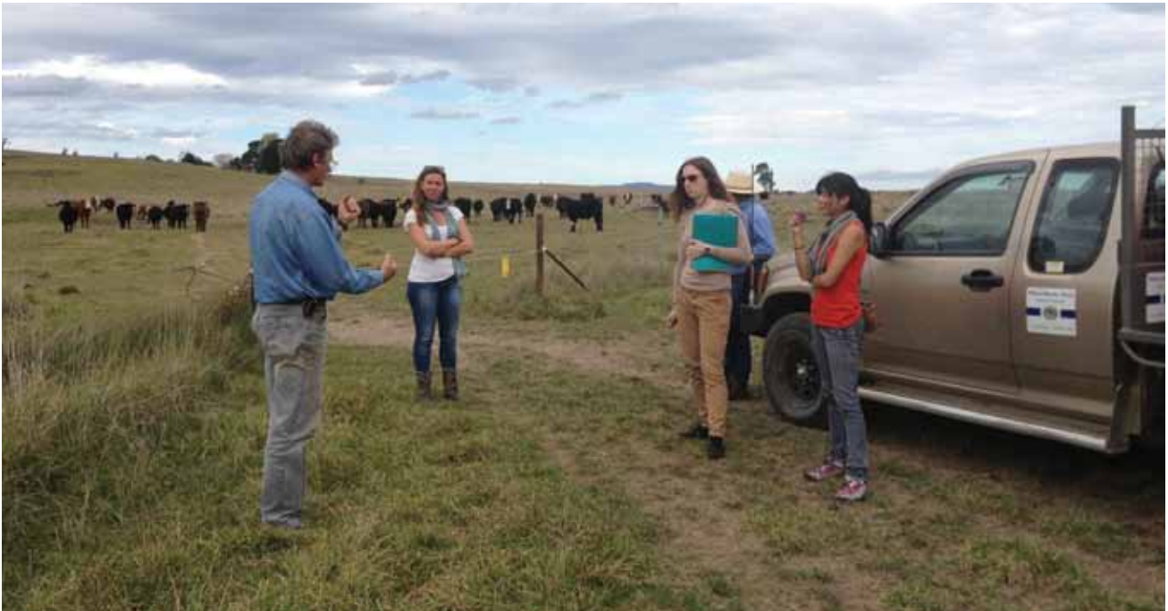
Western Creek ACT, My Farm Shop project