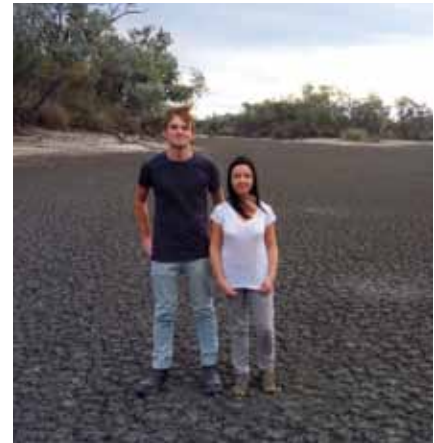
Bourke NSW, BioEnergy Carbon Farming project

4th EMES International Research Conference on Social Enterprise, Liege, Belgium, 1 - 4 July.