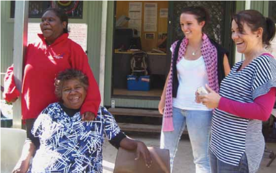
Rossville GLD, Bana Yarralji Bulka project