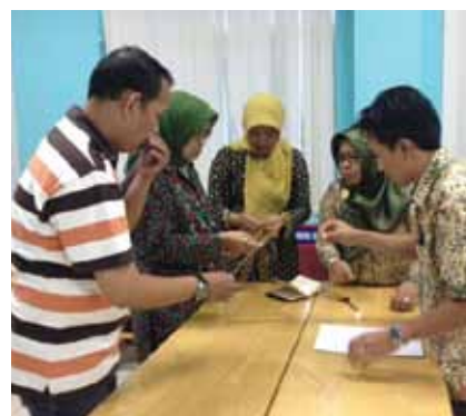
EDNA Vietnam, Collaborative Workshop