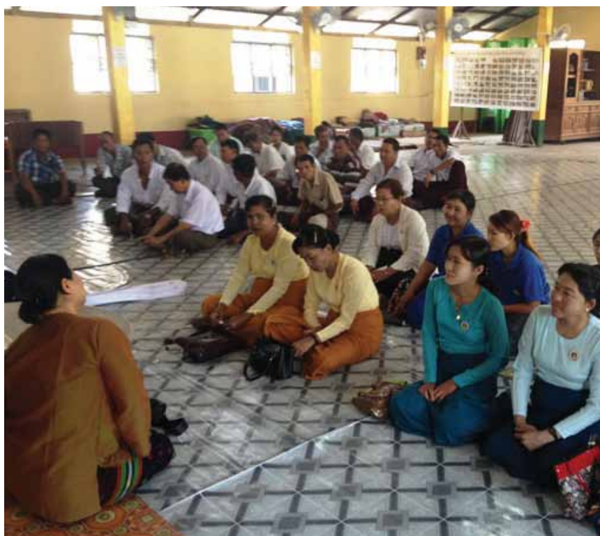
EDNA Myanmar, Grass-Root Entrepreneurship