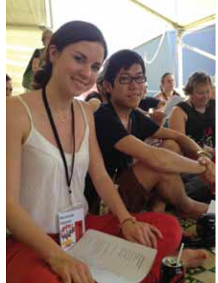
Katherine NT, Artback NT project