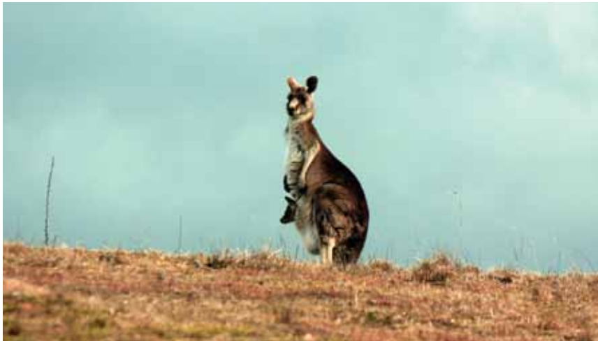
Eden NSW, Bundian Way project

We are growing the E&I Program's impact as well as reach. Some of this will come from existing initiatives, others from new undertakings.