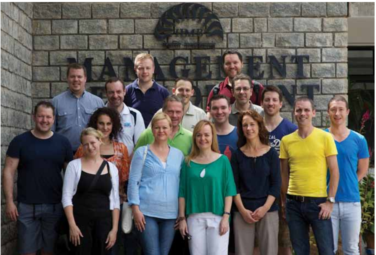
Top: Broken Hill NSW, Business and Architecture students, Bottom: Bangalore India, 2013 Executive MBA students