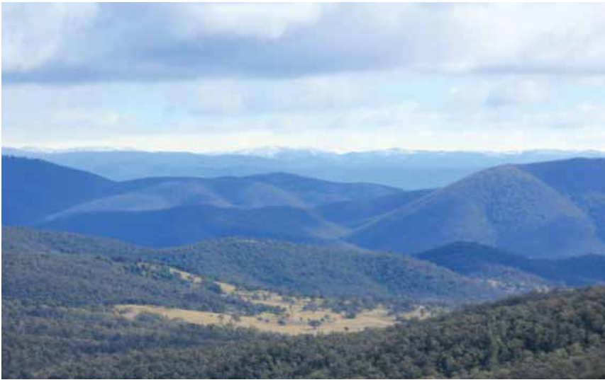
Eden NSW, Bundian Way project