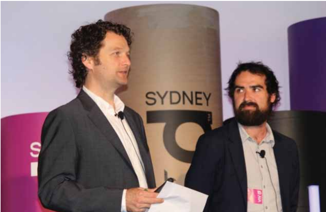
Vivid Sydney, Impact Measurement Workshop