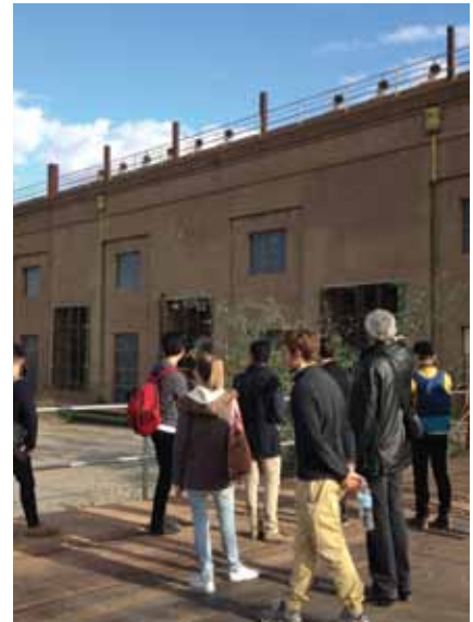
Broken Hill NSW, Rare Program Winter School project

There are many definitions of 'entrepreneur' and 'entrepreneurship'. Our E&I Program is built around the understandings implicit in the OECD-Eurostat Entrepreneurship Indicators Programme's definitions: