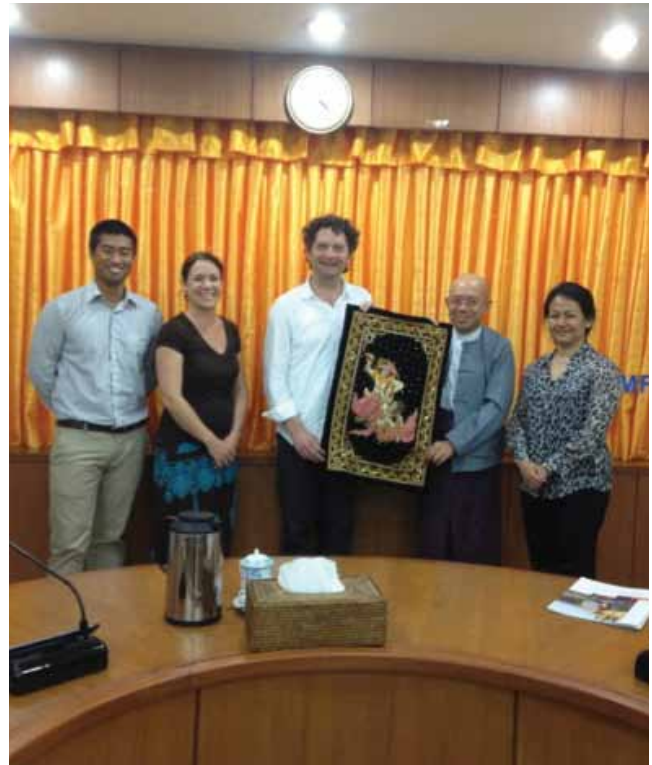
Edna Workshop with UMFCCI in Myanmar