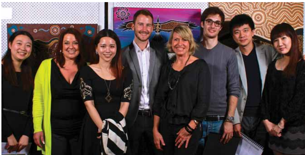
Singleton NSW, Ungooroo Aboriginal Corporation WUPA@Wanaruah event