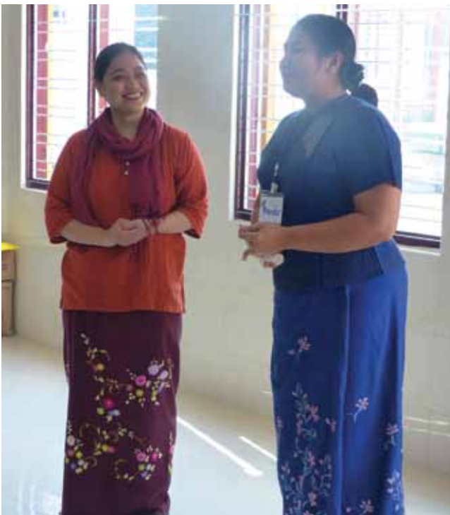
Top: EDNA Indonesia, Bottom: EDNA Myanmar