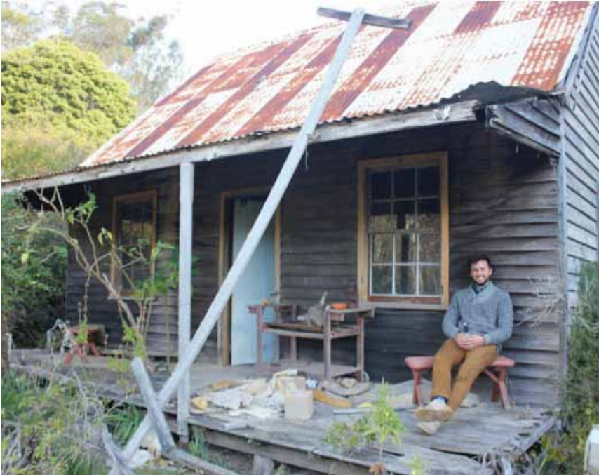
Eden NSW, Bundian Way project