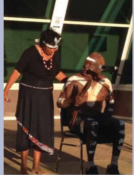
Alice Springs NT, Indigenous Economic Development Forum