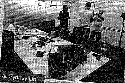
A workshop at Sydney Uni