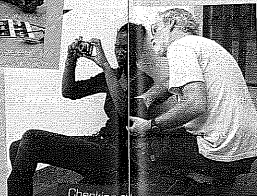
Checking out the pictures