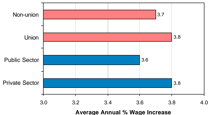
Figure 1.1: September 2002 quarter average annual percentage wage