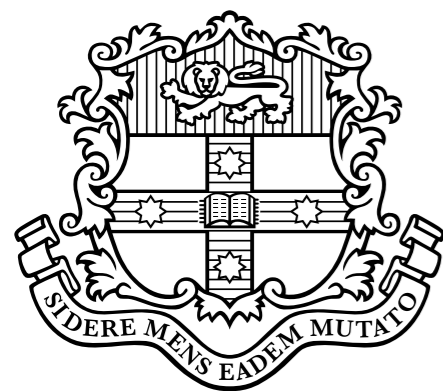
The Arms of the University