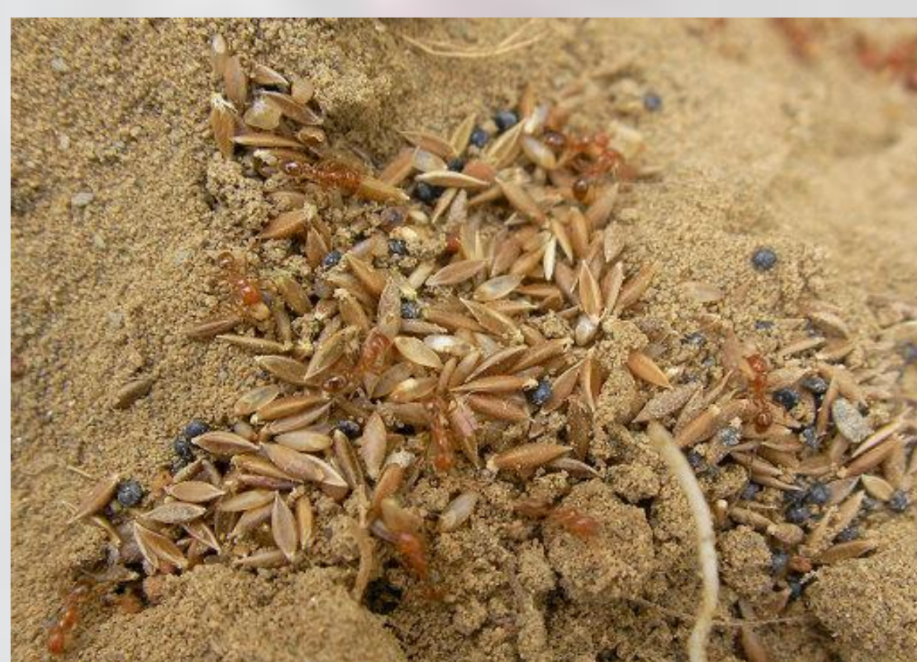
Fig. 2. A large quantity of Digitaria sanguinalis seeds and a bit of Amaranthus patulus seeds were collected in nest.