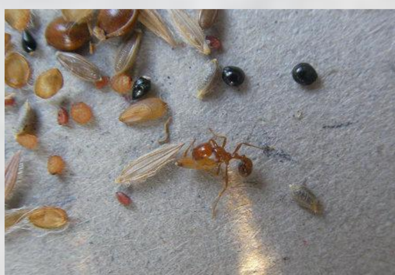
Fig. 3. Seeds were removed by Solenopsis geminata workers in seed preference experiments.