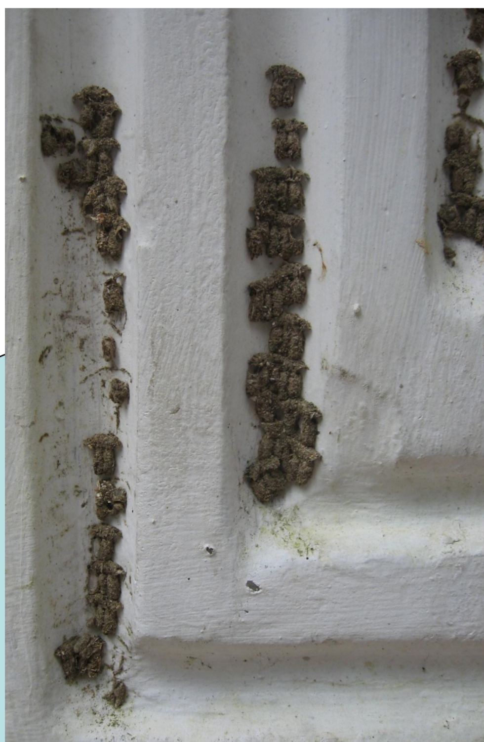
Nest cluster on the walls of a forest gazebo