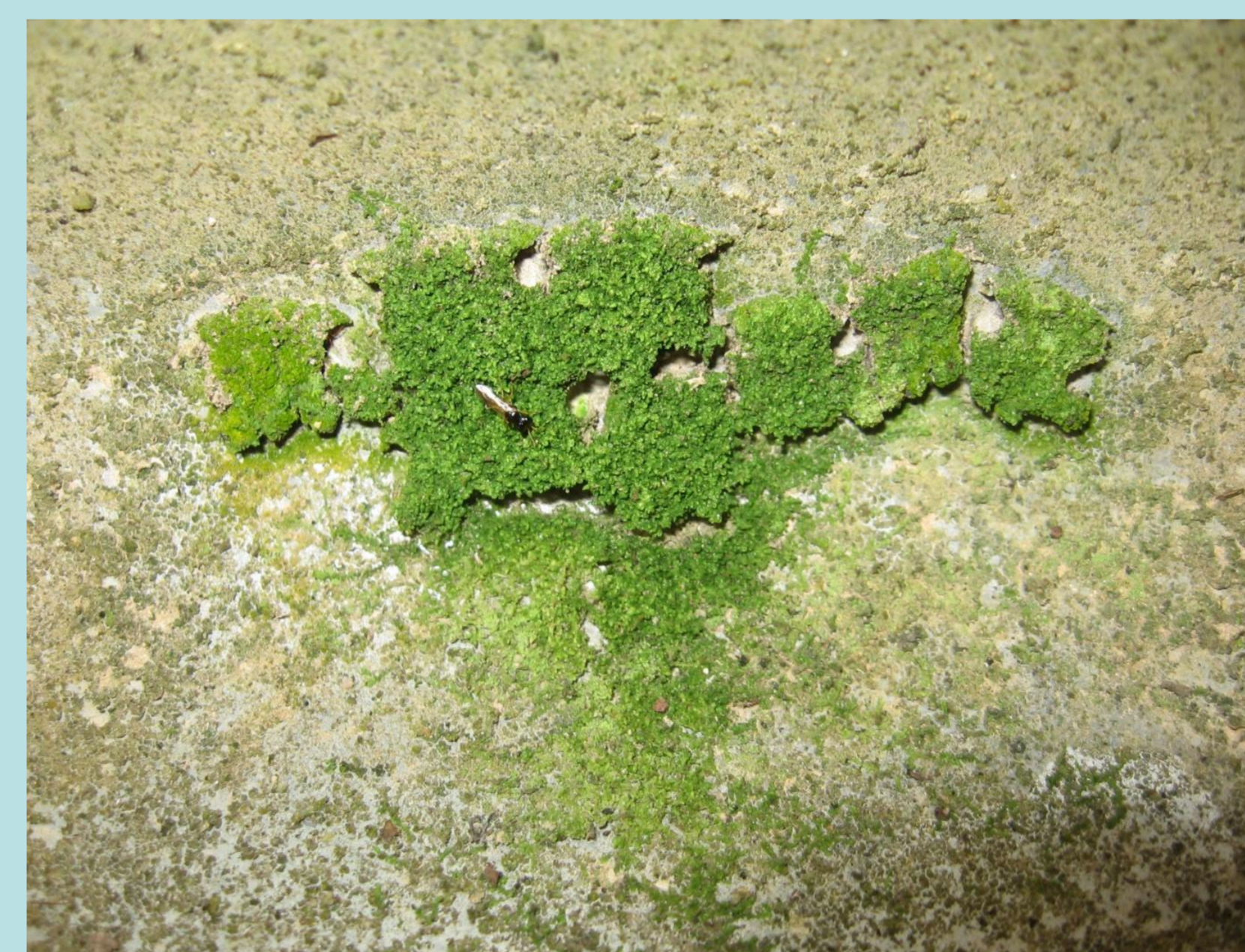
A nest covered with algae with a female on it. The length of the wasp is about half a centimeter

The cell opening is always situated at the higher part and is covered by a hood-like roof which protects the entrance from one side when the cell is isolated. When contiguous cells form a cluster, the roofs of each cell merge to form a common tube connecting the entrances of all the cells, becoming also a shelter for the adult individuals of the colony. Nests in some cases can be covered by algae and they can contain up to 60 cells, even though active nests were found only within the range of 3-39 cells (see Table). Active nests can be quite close to each other in some cases.