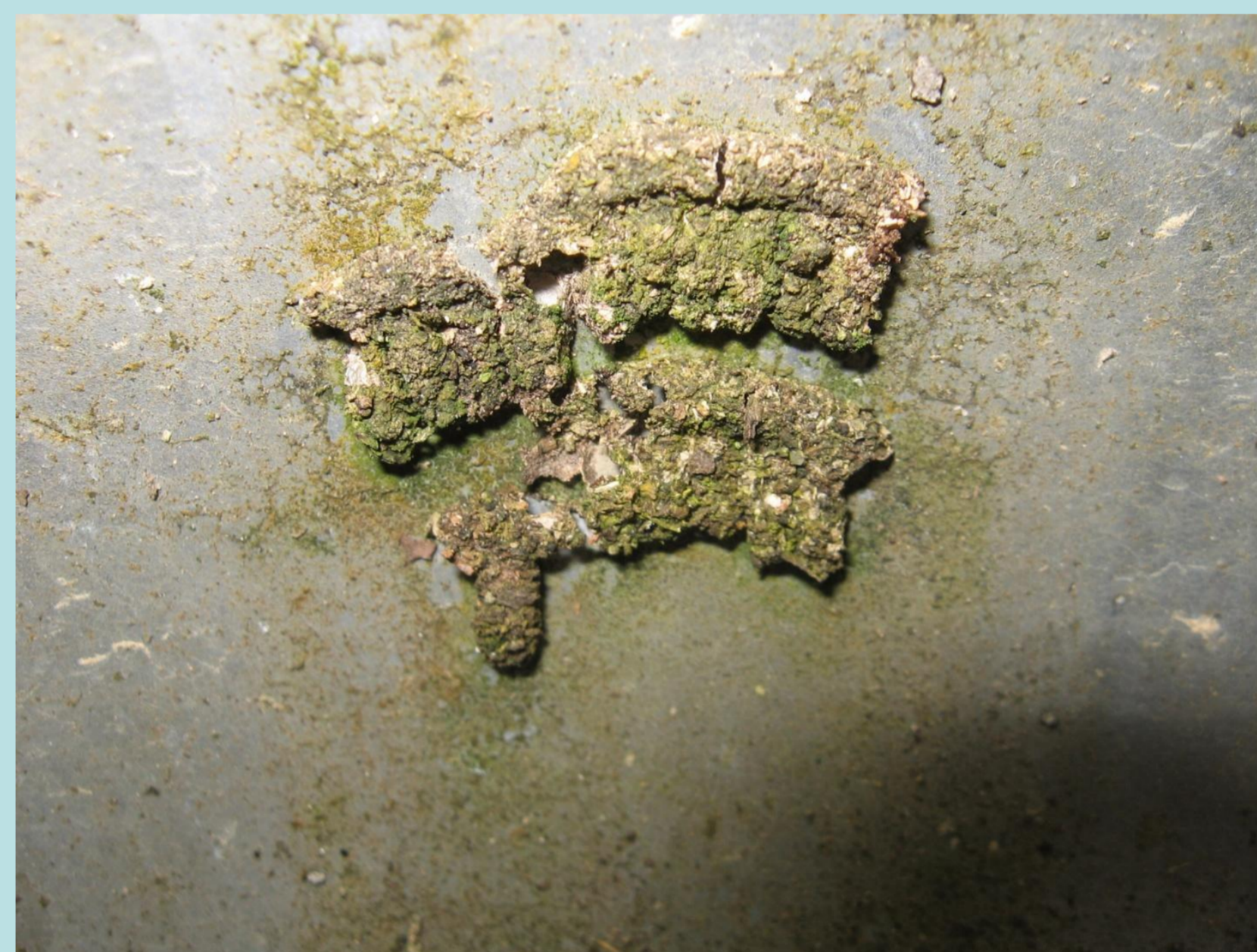
A nest formed by rows of cells connected by an upper tube

Nest architecture. The nest of Spilomena sp. has a peculiar architecture. It consists of cylindrical cells attached to a vertical plane substratum. This substratum makes nests, usually dark brown, highly visible to a human observer; evidently nests are well camouflaged on natural substrata as we never found any except those on artificial nest sites. The substratum forms part of the walls of each cell. Cells are placed, vertically, one beside the other forming clusters containing up to several cells. Each cell is attached to the substratum and clusters of cells have been never found superimposed, so nests which are composed of different clusters of cells (which is quite common) have always a flat extension.