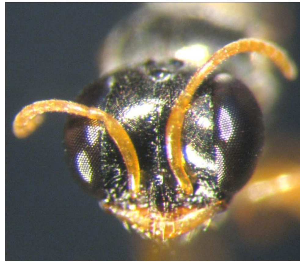
Head of female (up) and male of Spilomena sp.

Eusociality evolved various times independently in the superfamily Apoidea (Michener 1969) including among the apoid wasps of the family Crabronidae. The majority of the more than 8000 described crabronid species are characterized by solitary nesting habits but some members of one clade in the subfamily Pemphredoninae, the Spilomenina, have evolved relatively complex social behaviour (Matthews 1991). Division of labour and altruistic behaviours have only been ascertained in Microstigmus comes (Matthews 1968; Ross and Matthews 1989a and b). The present poster deals with an interesting, yet undescribed, species of Spilomena found in the Central Mountain Range of Peninsular Malaysia. This species forms multi-female colonies and builds nests characterized by a peculiar architecture. We report preliminary data on colony composition and other features of the biology, including a description of the nest.