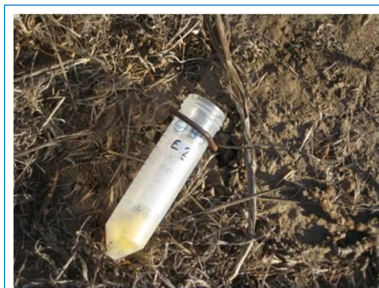
Figure 3. Close-up of sugar egg vial at a monitoring point.

In aid of creating such protocols, we conducted field trials to assess bait attractant efficacy for Argentine ant detection throughout the year. Two plots have been used to conduct this study and two have been set up for future replication. Each plot consists of 20 points, separated by 20m in a grid design. Non-toxic baits were set in a block design, 1-2m apart from each other surrounding the pitfall location and left for 24 hours (Figure 2). Three baits with different attractants were formulated based off of: 1) results from the Krushelnycky and Reimer (1998) paper on bait preference in Haleakala National Park, 2) on ease of use in the field and 3) overall cost. The three non-toxic baits were: