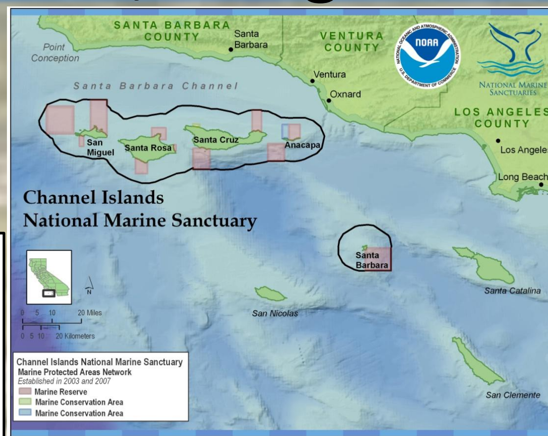
Figure 1. Map of California's Channel Islands

The Argentine ant, Linepithema humile (Mayr), is an extremely invasive ant species that has spread to urban, commercial and natural areas worldwide and this pervasive expansion has had detrimental ecological and economic effects. As a result, vast amounts of resources have already been allocated to the control of this species in urban and agricultural areas and new efforts are underway to control them in ecologically sensitive habitats, such as California's Channel Islands (Figure 1). As Argentine ant eradication efforts are implemented in these areas, the need for a standardized detection protocol is essential because if small populations of ants go undetected during pre- or post-treatment stages, then eradication will likely fail. Accurate detection of the few remaining nests is often challenging, and the small surviving populations often result in the failure of eradication program (Hoffman et al. 2011). The aim of this project is to develop an efficient detection protocol for Argentine ants. The first step of establishing these protocols is to determine the best bait to use for trapping Argentine ants.