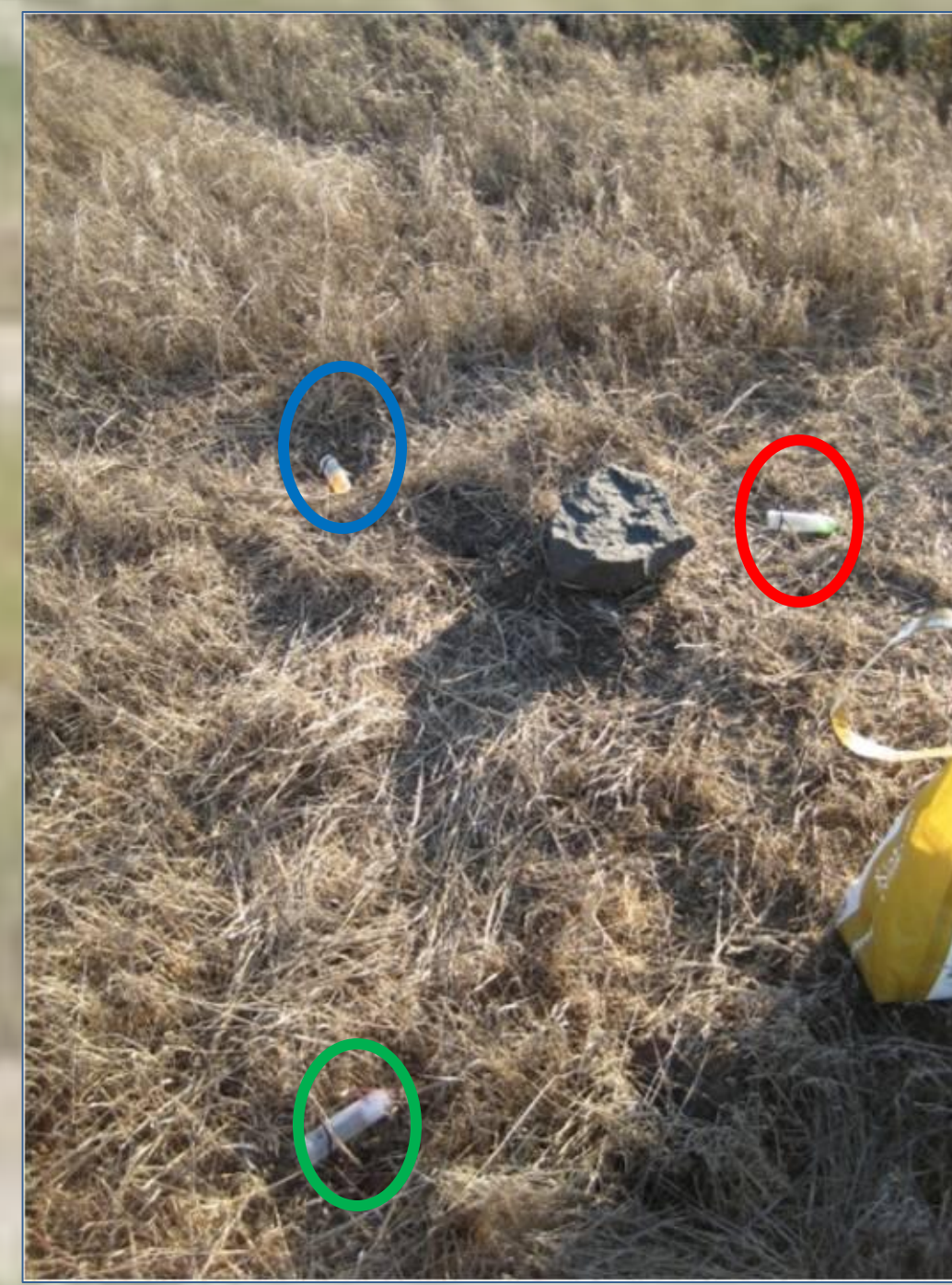
Figure 2. Non-toxic baits at monitoring point, each vial placed 1-2m apart.