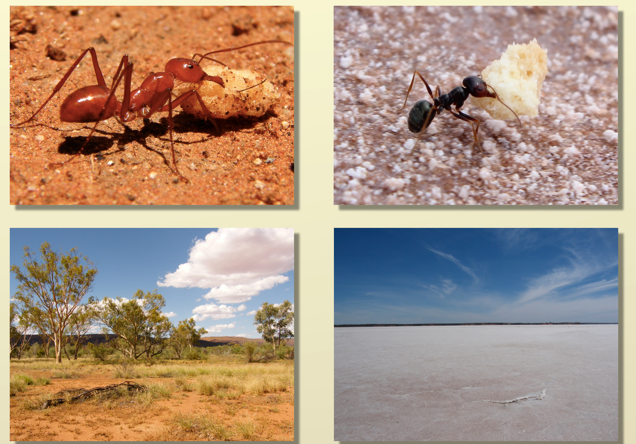
Fig. 1: The ant Melophorus bagoti and its cluttered desert environment (left), and the ant Melophorus sp. and its featureless salt-pan environment (right).

Ant species of the genus Melophorus are distributed all over Australia. We investigate the nest searching behaviour of two solitary foraging species that occupy vastly different visual environments: Melophorus bagoti inhabits cluttered grassland deserts of Central Australia, and the as yet unnamed Melophorus sp. inhabits featureless dry salt-pans (Fig. 1). Melophorus bagoti is well known to rely heavily on visual navigation, and to a lesser degree on path integration (NARENDRA 2007). Melophorus sp. has been shown to employ path integration (SCHULTHEISS et al. 2012), but our study is the first to investigate its visual navigational capabilities. We here focus on the question whether the navigational strategies of closely related desert ants are adapted to the visual complexity of their habitual environments.