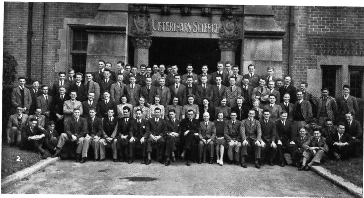
FACULTY OF VETERINARY SCIENCE.