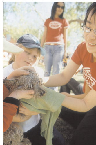
Students shampooed approximately 290 dogs at the 2002 Open Day.